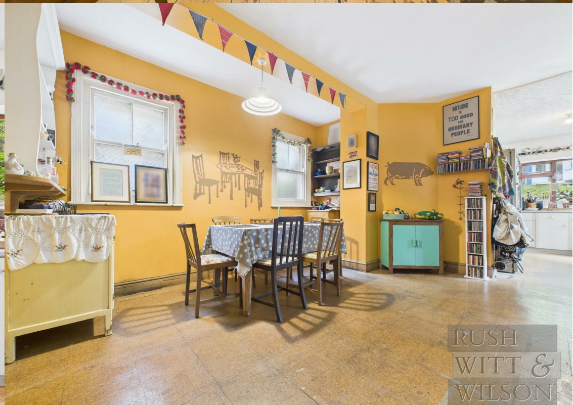
RUSH WITT & WILSON