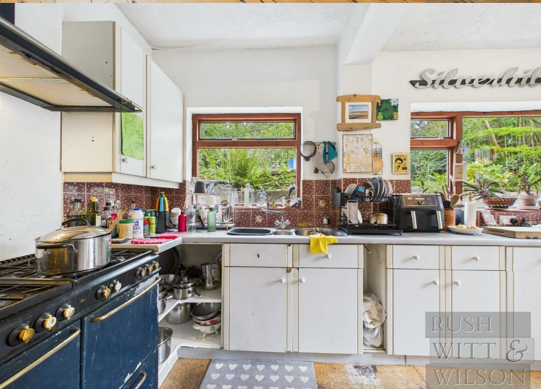
RUSH WITT & WILSON